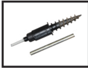
Ground Screw & Metal Arm