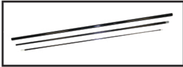
Stackable Sectional Poles

Remove all parts from cases. Separate all pieces. Number of pole pieces may vary depending on pole size.