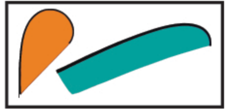
Drop or Sail flag