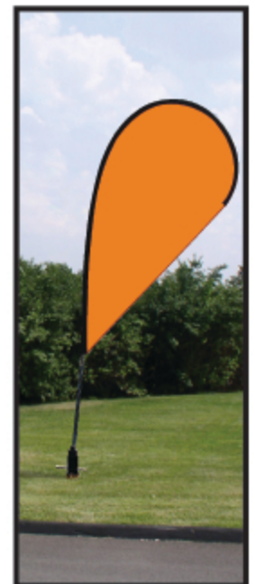
Completed Wind Wavers™ Drop & Sail